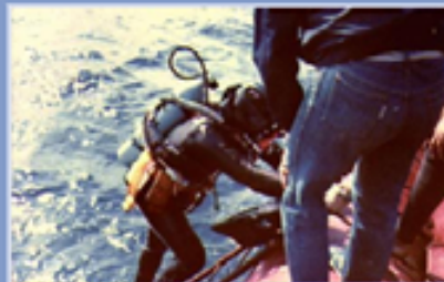
Diver under way to work

10 Ahmed Yehia St Gleem 21411 Tel: 03 - 5852899 - (10 lines) FAX : 587 4668 E.M : maridive@mosalex.com