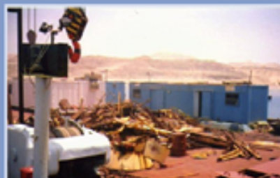
Removed wreck on Barge deck

16 El Gomhoria St. 42311 Shaher Group Building Tel:334134 - 221771 FAX : 23 6436