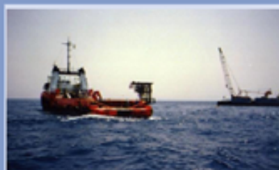
Work Barge & support vessel