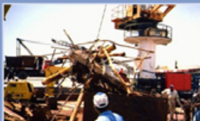
Wrech lefted by Barge Crane