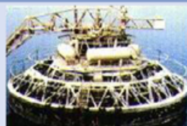
SPM after repair