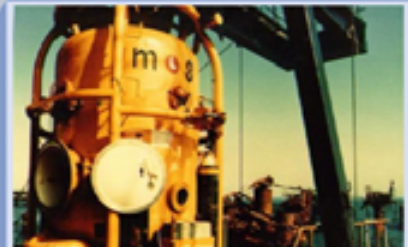
Sat. diving system

37, Cornish El Nil, Maadi Telephone: +2 02 23585204 Fax: +2 02 23581160 e-mail: mop@moscairo.com Website: www.mosalex.com