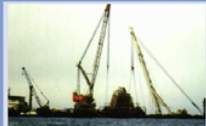
Work Barge in operation

10 Ahmed Yehia St Gleem 21411 Tel: 03 - 5852899 - (10 lines) FAX : 587 4668 E.M : maridive@mosalex.com